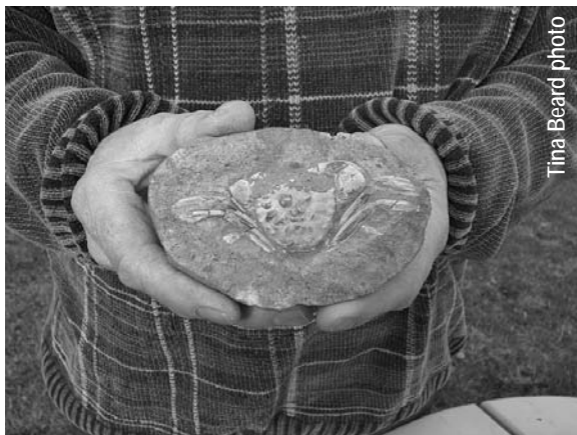
Fossil crab from Shelter Point