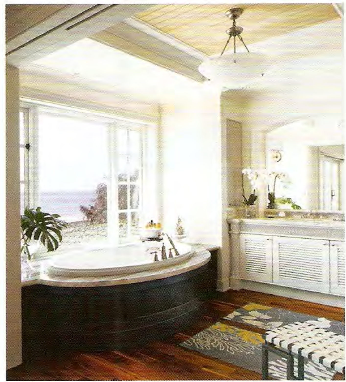
Black walnut floors accentuate the pale tropical tones illuminated by the large bare-all window, giving bathers a close up view of West Vancouver's shore.

This beautifully subtle piece of design, the gently curved banquette is complemented by the couple's choice of furniture. The oval dining table's custom-made top repeats the black