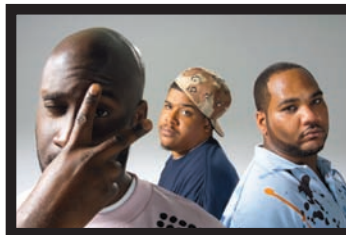
De La Soul

The Big Time Out 2008 promises to be extraordinary. I have to admit to emitting a little gasp when Schulman revealed the first few acts confirmed to play, especially in the case of New York hip-hoppers De La Soul. Once termed "The Sgt. Pepper of hip-hop" by The Village Voice magazine, their 1989 debut 3 Feet High and Rising is an acknowledged masterpiece and seminal release of the genre. Also scheduled are Emily Haines' unfeasibly cool new wave