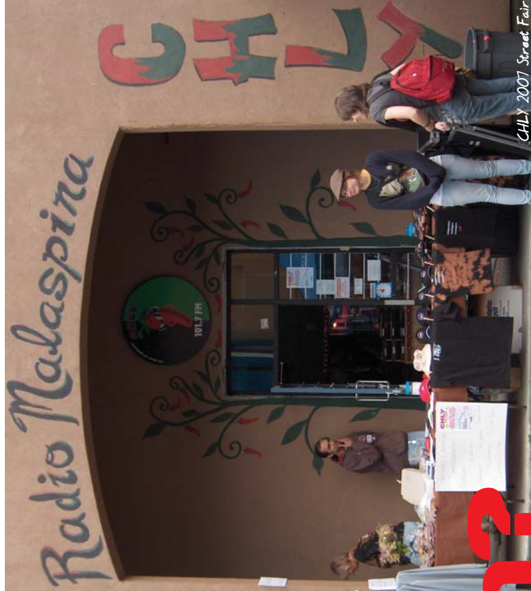
CHLY 2007 Street Fair

Listen to CHLY at 101.7 FM or online at www.chly.ca